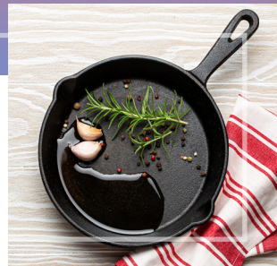
THURSDAY: A Surprise ...