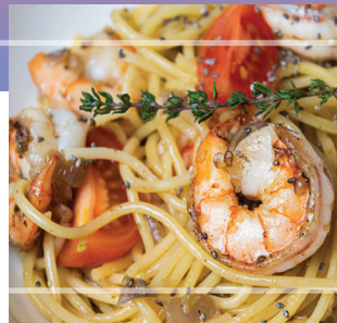
WEDNESDAY: Linguine Marinara